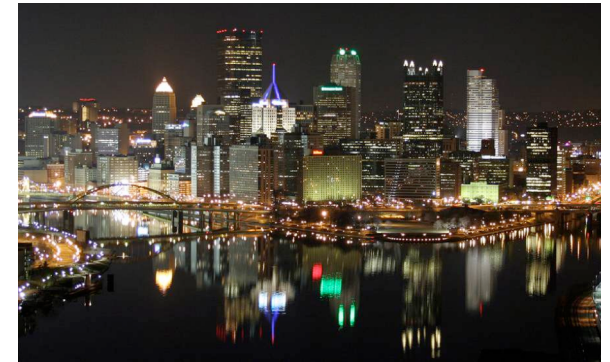
70 th Annual GEC - Pittsburgh, Pennsylvania

DoubleTree by Hilton Pittsburgh – Green Tree pittsburghgreentree.doubletree.com